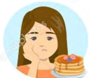
LOSS OF APPETITE