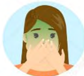
NAUSEA AND VOMITING